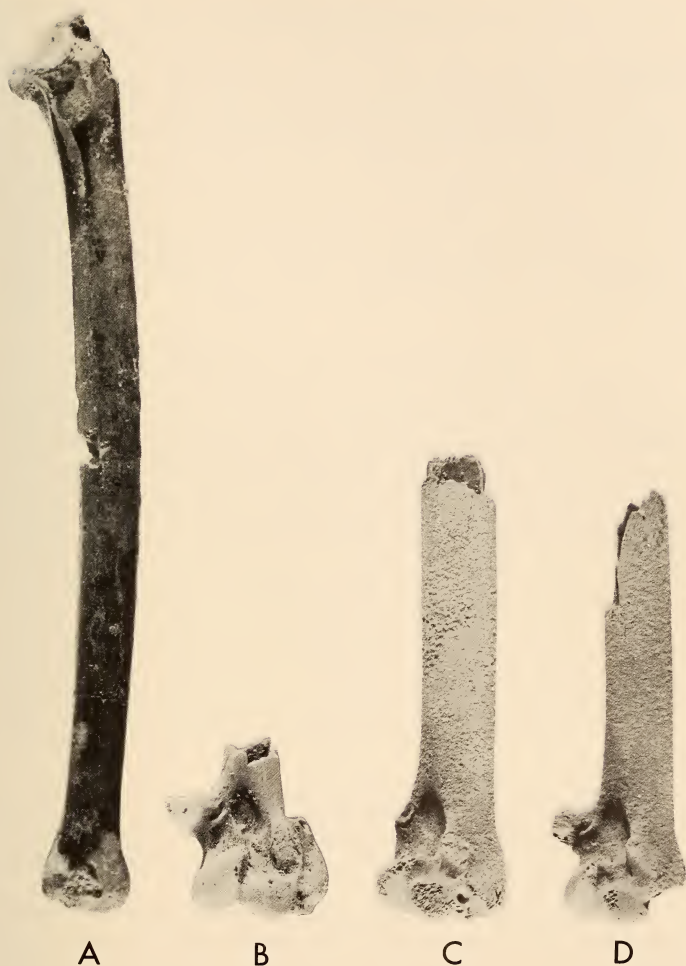
Fig. 3. Wing elements of Puffinus . A. Puffinus species A, MBD545, right ulna, ventral aspect. B-D. Distal ends of right humeri, cranial aspect. B. Puffinus species B, L25577F (Langebaanweg). C. Puffinus species B, MBD244 (Duinefontein). D. Puffinus species C, MBD337. All figures \times 2 .